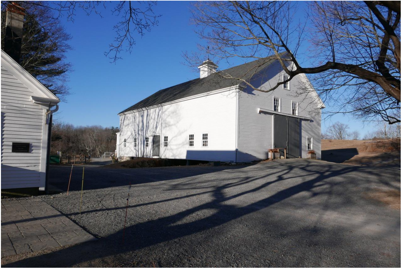
PHOTO 2 - SQUASH HOUSE SEEN FROM SOUTHWEST