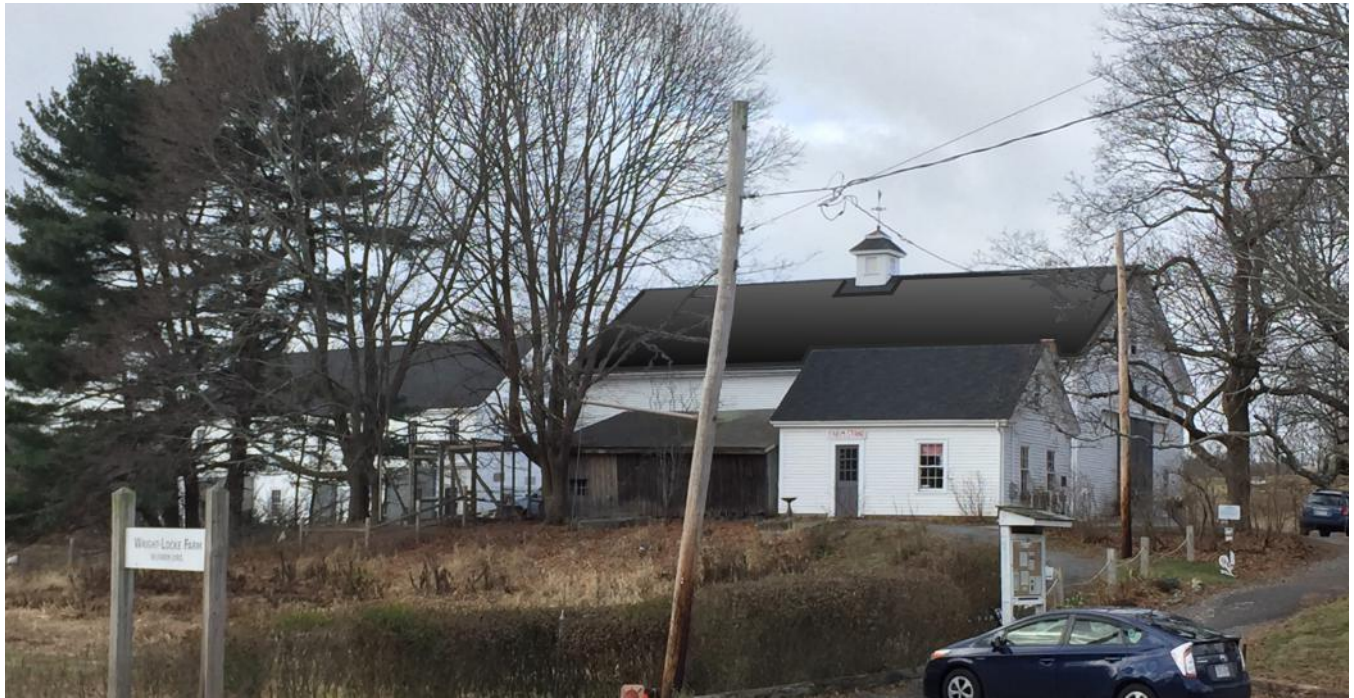
PHOTO 6 -DEPICTION OF SOLAR PANELS ON SQUASH HOUSE