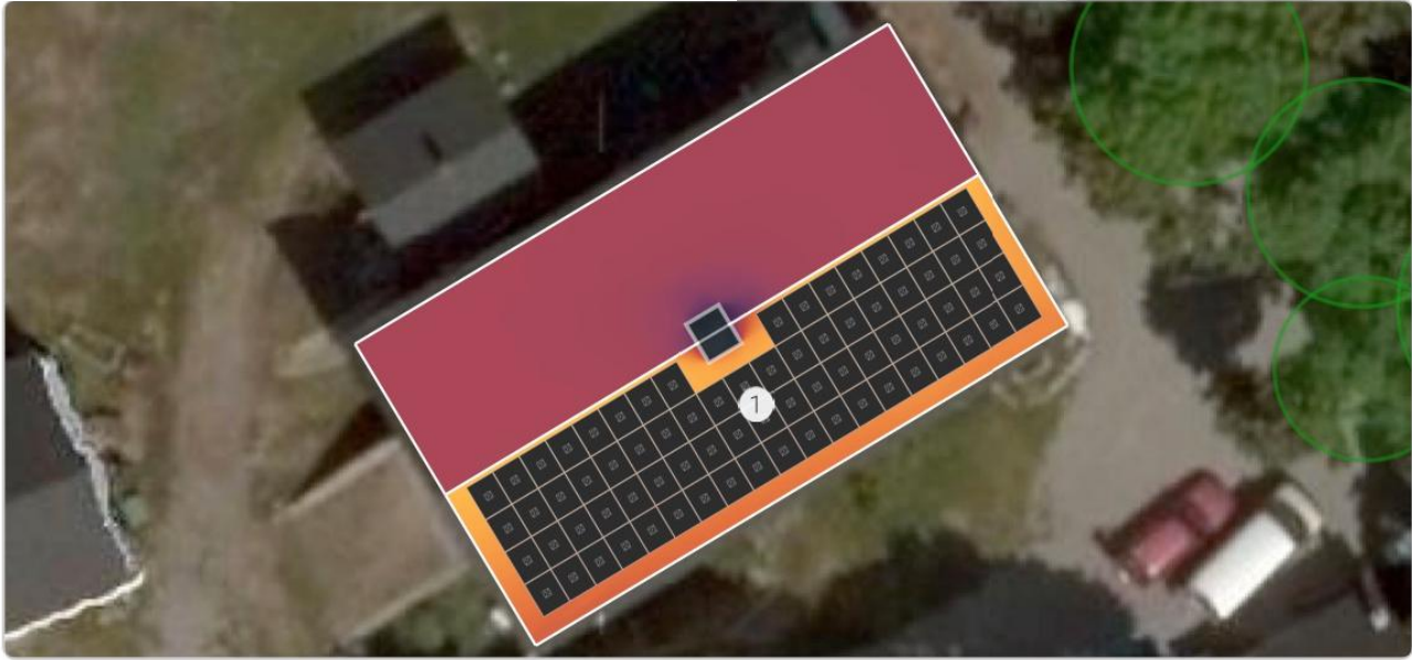
PHOTO 4 -LAYOUT OF SOLAR PANELS ON THE SQUASH HOUSE