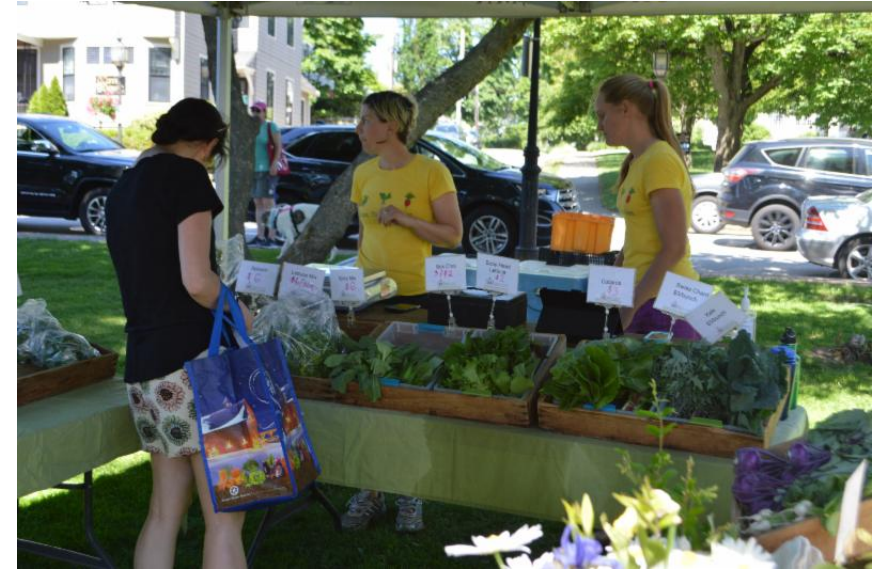
Now that the season is really kicking into gear, make sure that you come by for our organic produce and beautiful flower bouquets. You can find us...