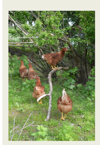
Pullets exploring their outdoor playground.