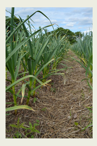
The Garlic is coming along nicely!