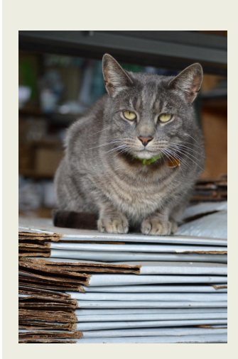
Buddy Cat guarding the CSA boxes